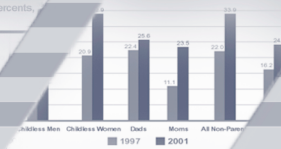
Figure 1: Percentage of PhD Cohort with Tenure at Research or Doctoral Universities Who Were Non-Parents During Graduate School.

American Sociological Association DEPARTMENT OF RESEARCH AND DEVELOPMENT