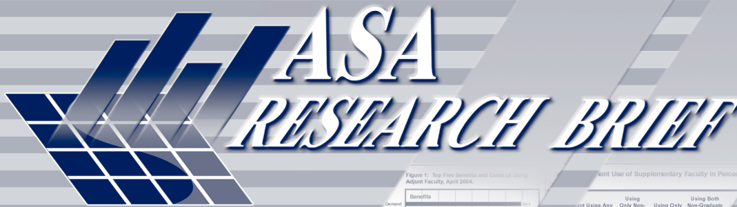
Figure 1: Top Five Benefits and Costs of Using Adjunct Faculty, April 2004.